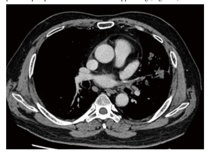
Figure 2. Pulmonary venous stenosis was= considered

parcel liquid pneumothorax of the left upper lung (Figure 4).