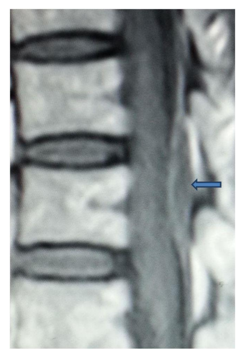
Figure 6. MRI PD image showing posteriorly located EDH and cord compression.