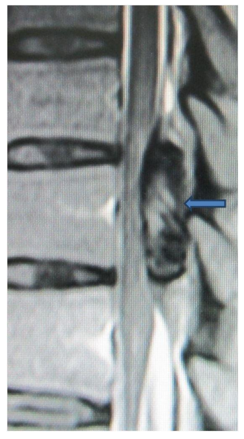
Figure 3. MRI T2 Image showing EDH with bright and dark signals and cord edema.

compressive pathologies (Wang et al., 2011). Trauma and iatrogenic causes seem to be the most important and common causes reported against a setting of certain precipitating factors such as coagulopathies including Hemophilia B and factor XI deficiency (Steinmetz et al.,