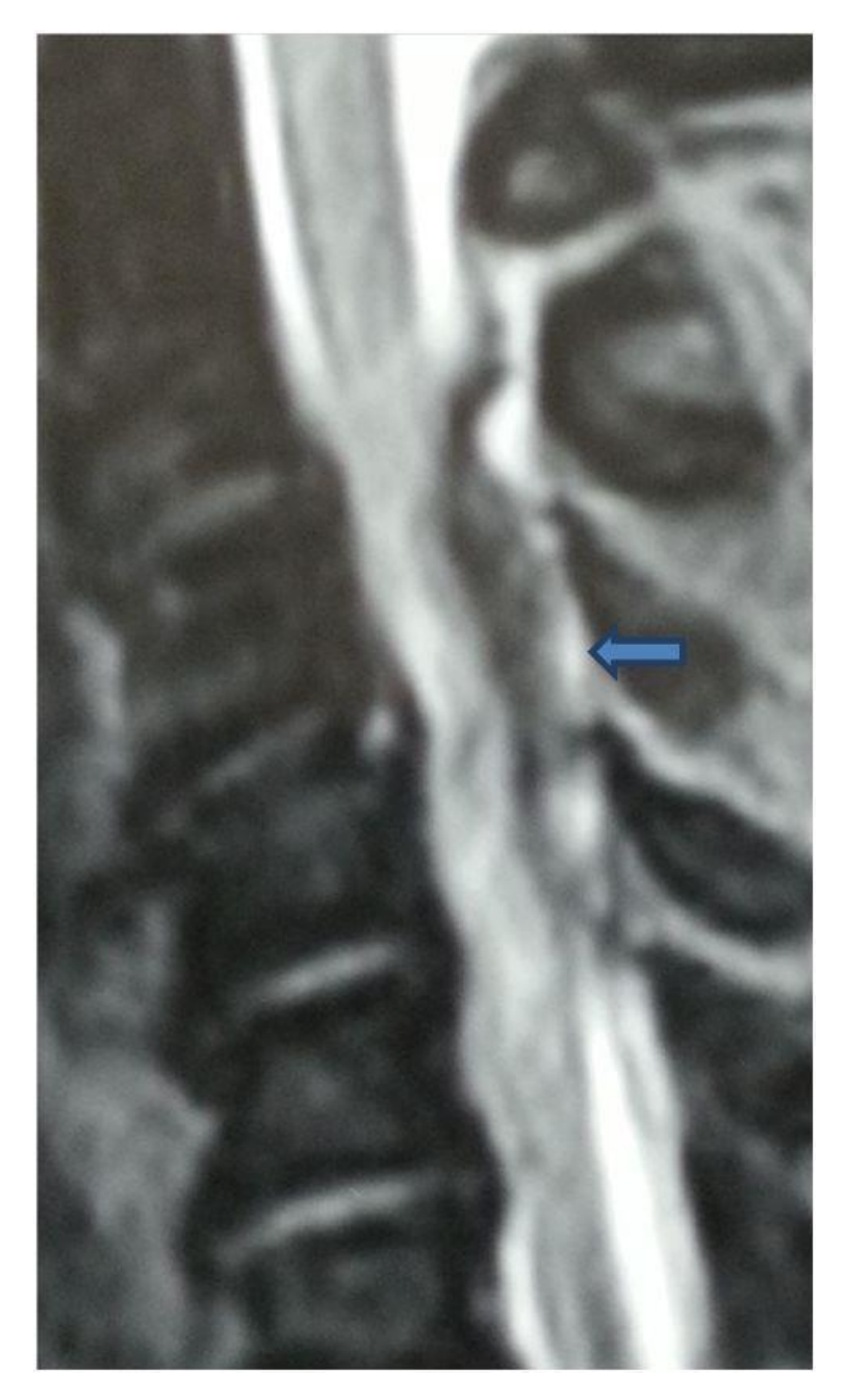
Figure 1. MRI (gradient echo) showing cervical EDH posterior to cord.

complained of local pain which was initially alleviated with use of Paracetamol and local application of Volini Gel. About 46 hours later, she developed weakness of both legs along with retention of urine. When clinically examined, it revealed a distended palpable bladder with paraparesis 4/5, normal Deep tendon reflexes, and sensory blunting below D-10 level for fine touch only. There was a large bruise on the back over the dorsal region with local tenderness. Her X-Ray dorsal spine did not reveal any abnormality. However MRI revealed a large epidural hematoma (Figures 3 and 4).