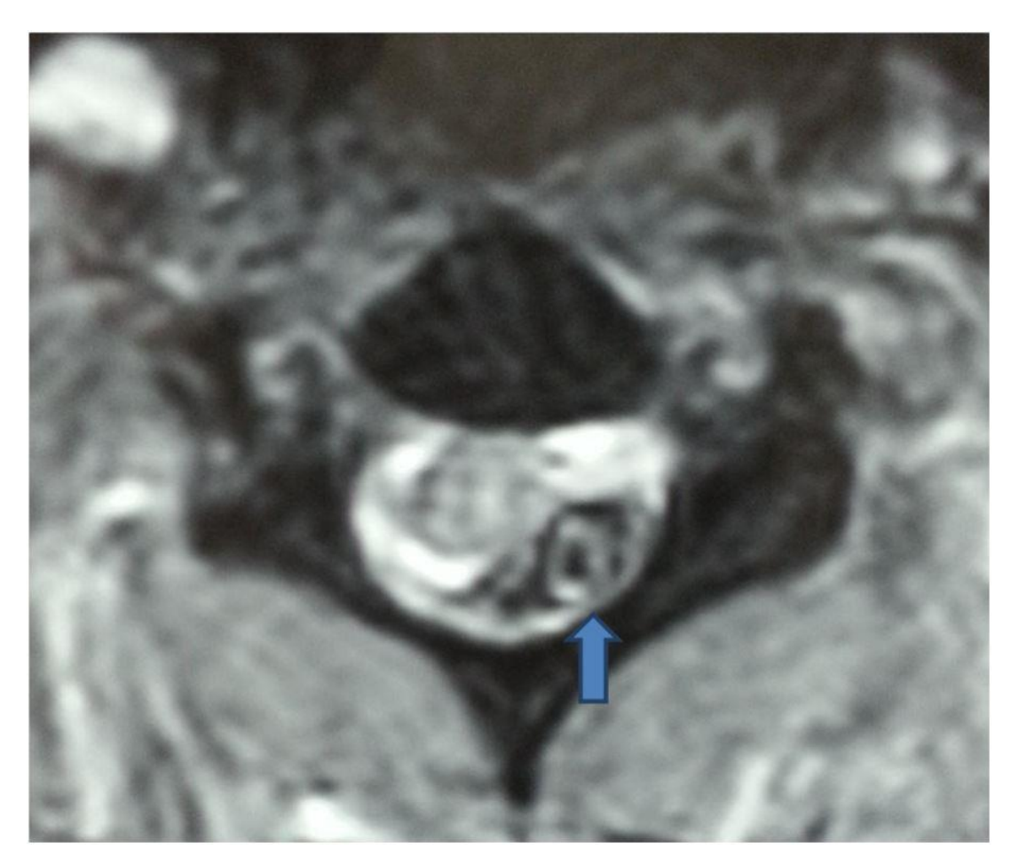
Figure 2. MRI (gradient echo) showing cervical EDH posterolateral to cord.

about 8 km. He felt numbness in both the legs. He took analgesics. Next morning when he got up, he was unable to move his legs and was unable to pass urine. He was seen by a neuro-physician and clinical evaluation revealed sensory impairment below D-6 level with flaccid paralysis of both lower limbs. His bladder was distended. His MRI was performed in emergency and it revealed a dorsal spinal extradural hematoma.