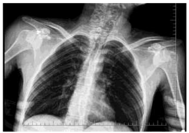
Figure 1. Bilateral shoulder dislocation is seen in posteroanterior x-ray.