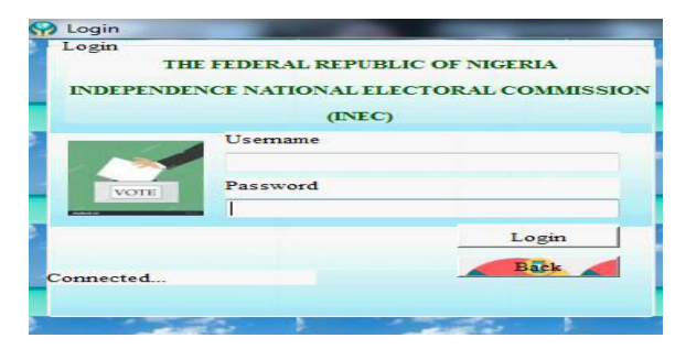
Figure 6. Log In page for INEC official

If user is INEC official, he/she click on the "INEC REC" button, and interface figure 6 LOGIN PAGE appear.