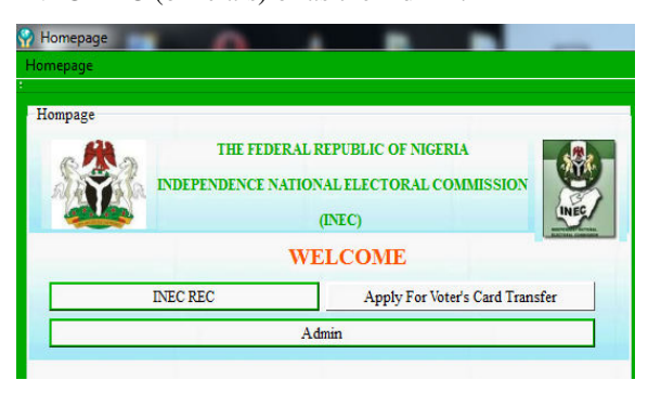
Figure 3. Welcome Screen

Figure 3 is the proposed system welcome screen where the user start to interact with the system. Here, the user/voter can either apply for the voter's card transfer, login as the INEC REC (officials) or as the Admin.