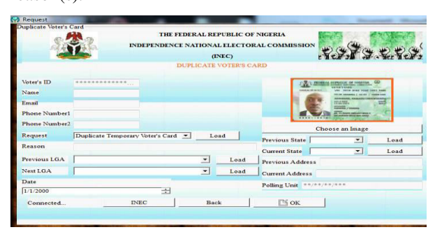
Figure 4. Applicant Users Interface

When click on apply for Voter's Card button is clicked the request page pops up. Here, the user/voter can now request for the duplicating of his/her voter's card and give the reason(s).