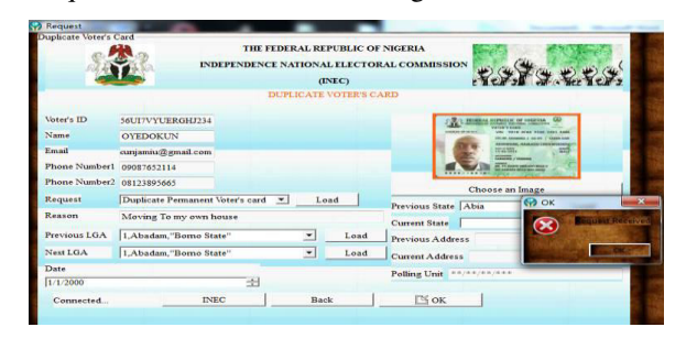
Figure 5. Screen that shows Completion of Application

After all the application form is filled, applicant will then click OK button is clicked a message pops up saying Request Received as shown in figure 5.