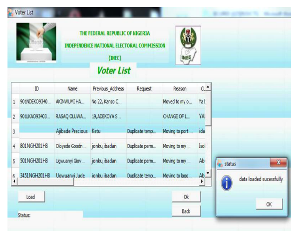
Figure 7. Voter list page:

After successful log in, Voter's list Page, appear and applicant can then be selected from the voter list for transfer or to delete from old list. See figure 7.