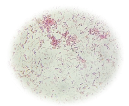
Figure 1. Microscopic image of Gram staining bacteria at 100x magnification.

Antibacterial assays were carried out by the disc diffusion technique. Clear inhibition zones around the paper discs