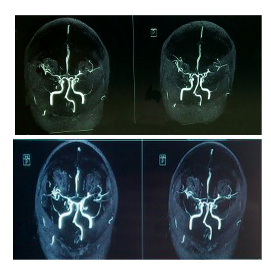
Figure 2. Cervical magnetic resonance angiography showing a significant occlusion in the proximal part of the left subclavian artery.

occlusion in the proximal part of the left subclavian artery (Figure 2).