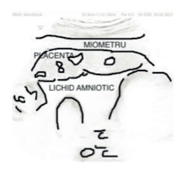
Figure 3 - Anterior placenta in the third trimester of pregnancy: hyperechoic placenta is surrounded by the hypoechoic myometrium, some calsifications and vascular lacs are seen.

Thus, in the first, second and third trimester of pregnancy, we will examine: