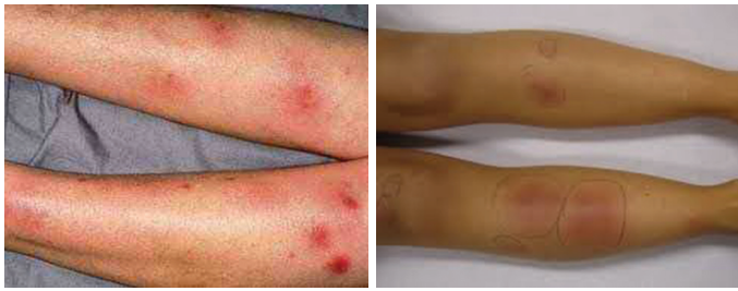
Figure 1 - Erythema Nodosum

Two thirds of patients with sarcoidosis generally have a remission within a decade after diagnosis, with few or no consequences; remission occurs for more than half of patients within 3 years. Unfortunately, up to a third of patients have unrelenting disease, leading to clinically significant organ impairment. A recurrence after 1 or more years of remission is uncommon (affecting <5% of patients), but recurrent disease may develop at any age and in any organ. Less than 5% of patients die from sarcoidosis; death is usually the result of pulmonary fibrosis with respiratory failure or of cardiac or neurologic involvement [35].