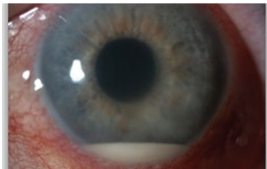
Figure 4 - Uveitis with hypopyon

The eye and adnexa are involved in 25 to 80% of patients with sarcoidosis, necessitating routine slit-lamp and fundoscopic examination. Anterior uveitis is the most common manifestation, occurring in 65% of patients with ophthalmologic involvement; chronic anterior uveitis, with insidious symptoms leading to glaucoma and vision loss, is more common than acute anterior uveitis. Posterior-segment involvement is reported to occur in nearly 30% of the patients with ocular sarcoidosis and is frequently accompanied by central nervous system involvement [49] [Figure 4].