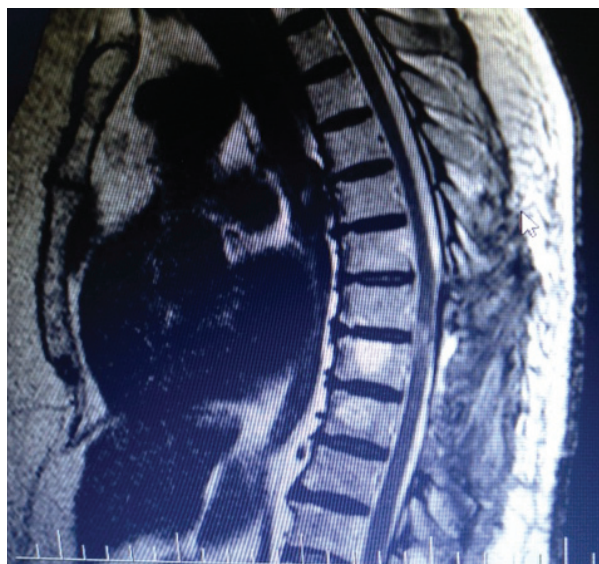
Figure 2: On MRI, sagittal section image of spinal canal there was seen no residual mass postoperatively

Postoperatively, the complaints of lower back pain and sciatica recovered. On the MRI sagittal section imagination, no residual mass was seen postoperatively (Figure 2).