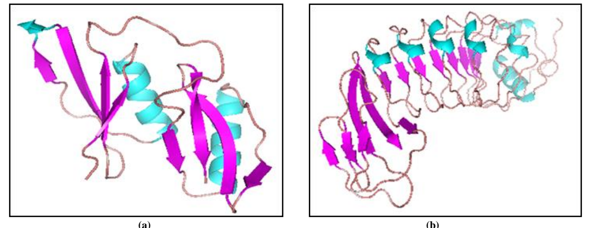
Figure 1: Predicted structures of (a) EGF38751.2 and (b) EGF38918.2

As discussed earlier, EGF38940.1 was predicted to be a part of YycFG twocomponent system. Consistent with this