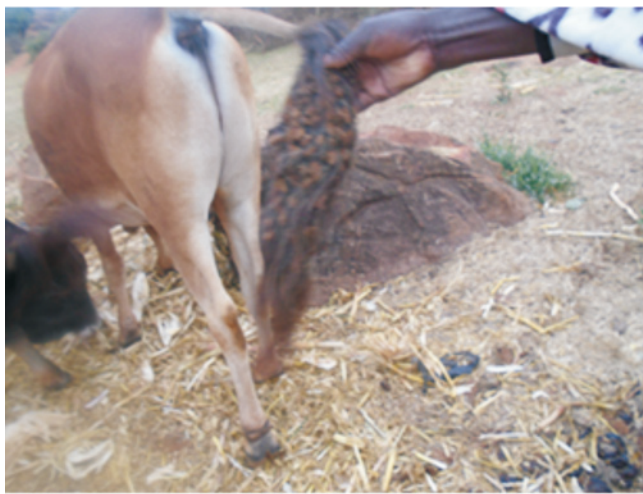
Figure 3. X. strumarium fruits cling to the hide of animals (a photo taken during field survey).