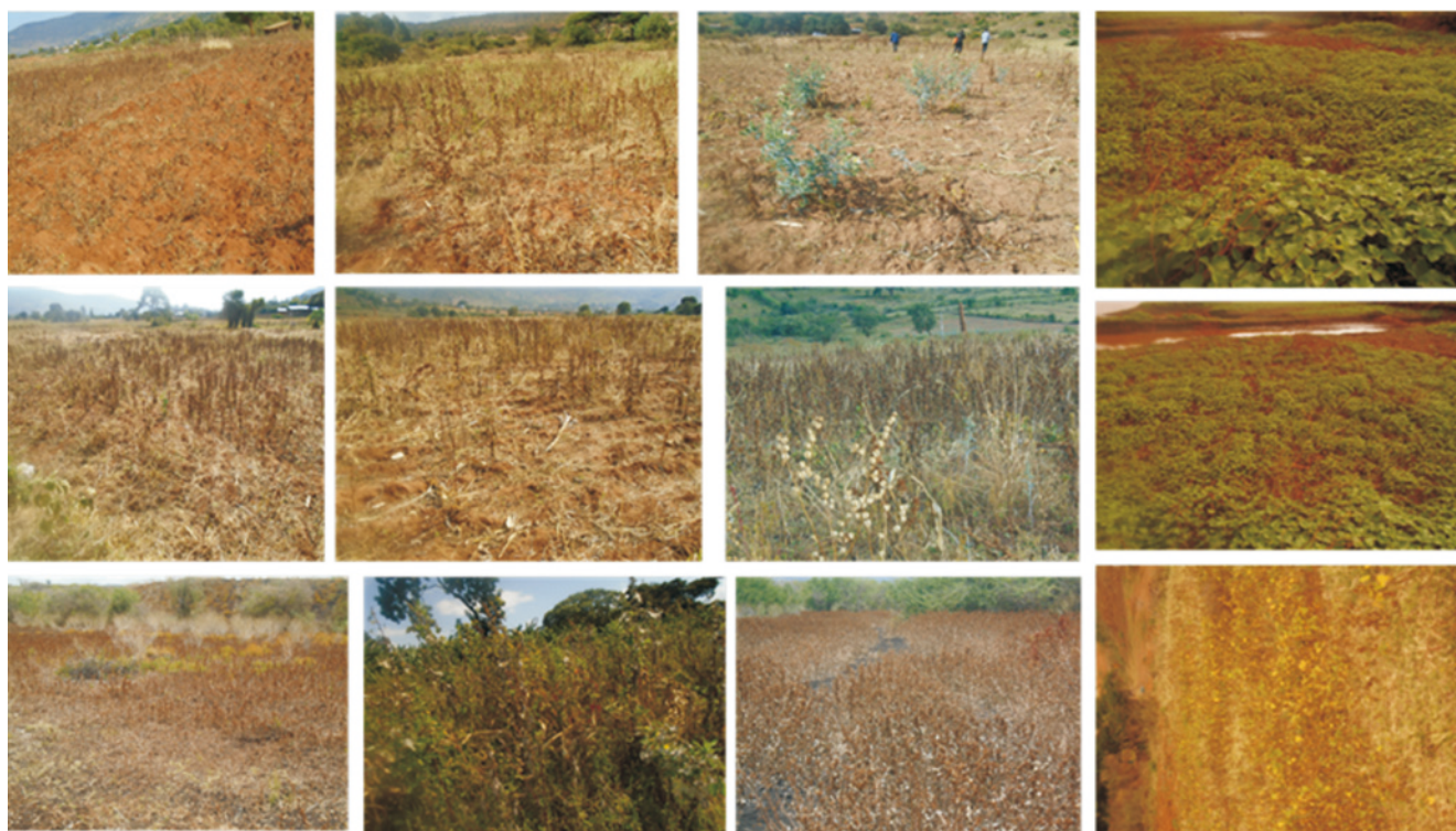
Figure 2. Status of X. strumarium in the study area.

All respondents (100%) informed that agricultural fields, disturbed lands and wet lands were the main habitats which were mostly invaded by X. strumarium . Of this, 79.70% informed that X. strumarium was mainly found on their agricultural field and the