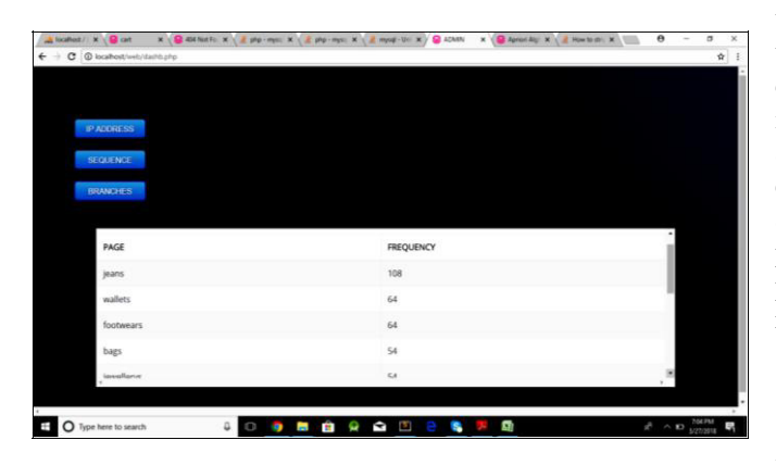
Figure 3.Represents the Output window for STA

From the above figure 3 ,we can clearly identify that there is a list of items displayed along with their frequency values in terms of integer values.Here for each and every product there will be a set of recommendations made by the individual users ,so all these recommendations are collected and finally their performance value is calculated by applying the STA approach.