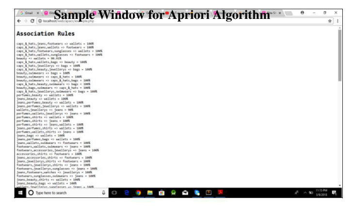
Figure 4.Represents the Output window for Apriori Algorithm

From the above figure 3 ,we can clearly identify that there is a list of items displayed along with their frequency values in terms of integer values.Here for each and every product there will be a set of recommendations made by the individual users ,so all these recommendations are collected and finally their performance value is calculated by applying the STA approach.