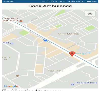
Fig. 3 Location detector page

Once user logs in successfully, he can broadcast message to the rescue team and ask for help. In addition to chat, location of trapped person will be added in chat editor. Rescue team can view the location of the person and provide assistance.