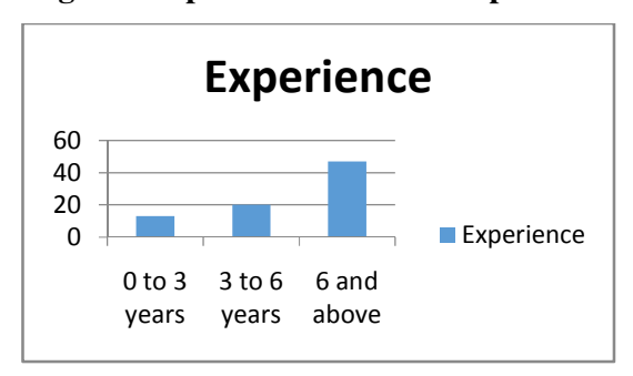
Fig 3.2 Respondents based on experience