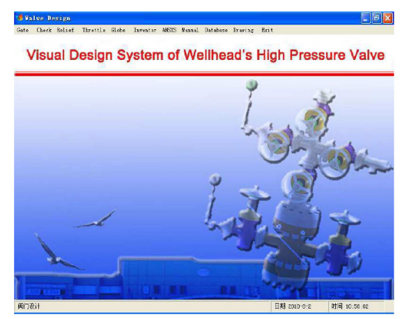
Figure: 3 the system main interface

of product serialization, and reduce the cycle of development of product, reduce the cost.