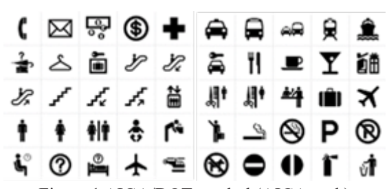
Figure 1 AIGA/DOT symbol (AIGA, n.d.)

However, pictograms are very useful in the signage for three reasons: (1) They are able to save space of sign; (2) the meaning of symbols can overcome the language barrier; especially to people who may not speak the native language of its place; (3) Sometimes they can help communication more clearly than words i.e. arrows. Pictograms communicate visually rather than verbally. This is supported by previous study finding that