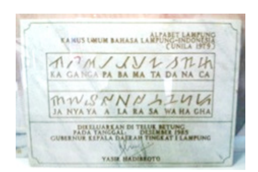
Figure 4 Lampung Script (Clara, 2016)

symbols replace the word no smoking; the cup and hamburger symbols replace the word restaurant on a sign. However, man/ woman symbols are universally understood since they depict simple concept. Those pictograms can be paired with typographic message on signage. This pairing, however can be useful in multilingual signage environment i.e. museum.