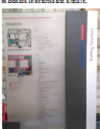
Has some pictograms that inform the prohibition on any objects that should not be brought in. The sepictograms are paired with typegraphic messages m Bahasa Indonesia and English.