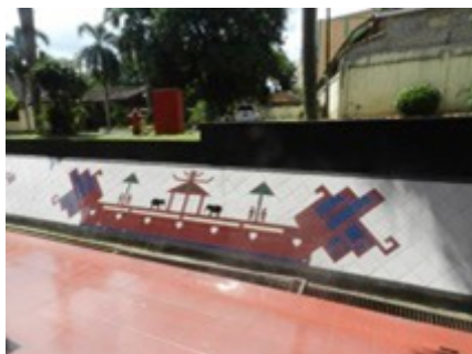
Figure 2 the building ornament (Clara, 2016)