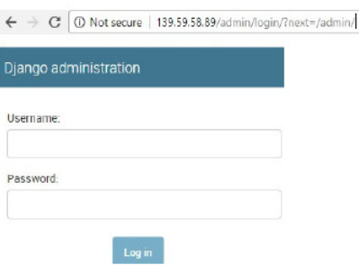
Figure 6: Output display

This login module is similar to login screen. So the unique identifier for each user will be their phone numbers. Name This will accept and store the users first name. Last Name This will accept and store the users last name. Phone Number This will accept and store the users phone number. Enter your name and password to login.