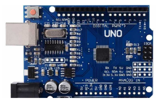
Figure 3: Arduino Uno

The Arduino Uno is a microcontroller board in view of the ATmega328 (datasheet). It has 14 advanced information/yield pins (of which 6 can be utilized as PWM yields), 6 simple sources of info, a 16 MHz artistic resonator, a USB association, a power jack, an ICSP header, and a reset catch.