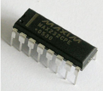
Figure 4: MAX232

gadgets that generally needn't bother with some other voltages. The beneficiaries lessen TIA-232 information sources, which might be as high as ±25 volts, to standard 5 volt TTL levels. These collectors have a run of the mill limit of 1.3v and a run of the mill hysteresis of 0.5 volts.