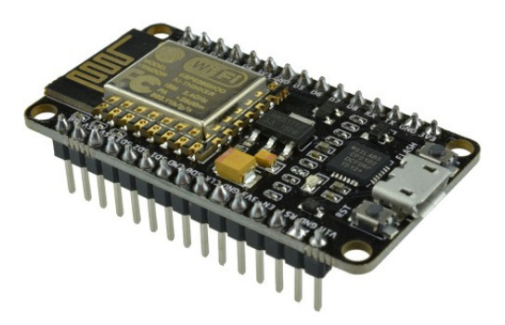
Figure 5: ESP-12E BASED NODEMCU

The ESP8266 is the name of a miniaturized scale controller composed by Espressif Systems. The ESP8266 itself is a independent Wi-Fi organizing arrangement offering as a connect from existing smaller scale controller to Wi-Fi and is likewise fit for running independent applications. This module accompanies an implicit USB connector and a rich combination of stick outs. With a smaller scale USB link, you can associate Node MCU devkit to your workstation and streak it with no inconvenience, much the same as Arduino. It is too promptly breadboard well disposed.