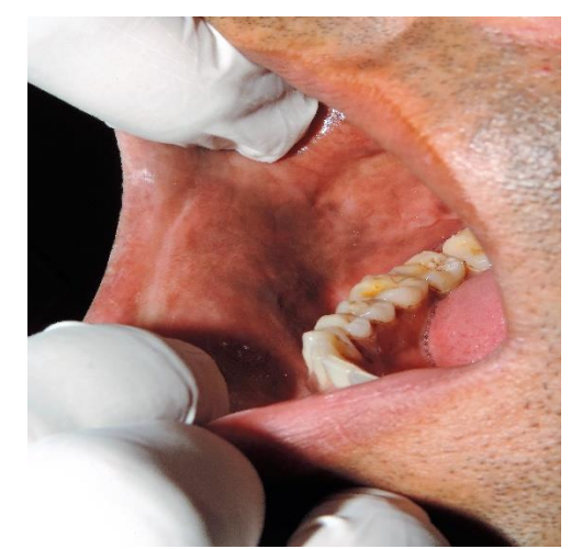
Fig. 1: Black-brown pigmentation involving the right buccal mucosa