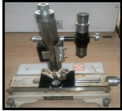
Fig. 11: Measurements of reference points