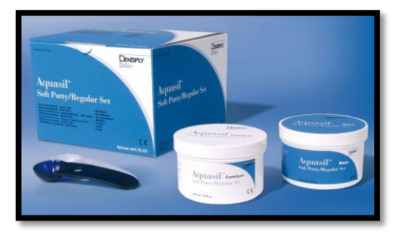
Fig. 1: Aquasil Impression material(Putty)