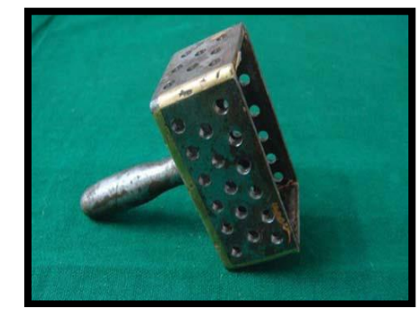
Fig. 3: Custom tray