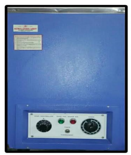
Fig. 5: Acrylizer