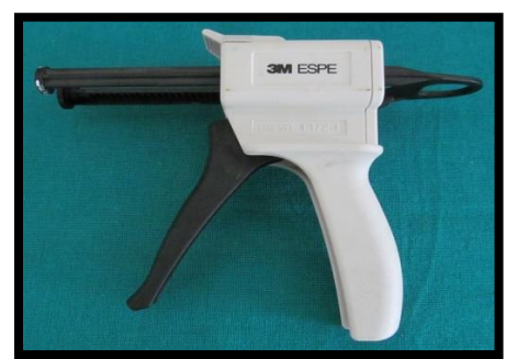
Fig. 9: Auto mixing dispensing gun

Measuring technique: A total of four measurements (2 horizontal and 2 vertical) were made on the control group cast (10 samples) and on 20 samples casts using travelling microscope with accuracy 0.01mm. For every measurement combination of each site was measured three times. The mean value and standard deviation of three readings were calculated and reported for the two horizontal and two vertical measurements.