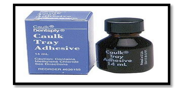
Fig. 4: Tray adhesive