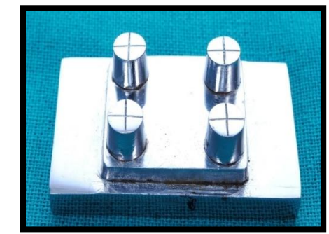
Fig. 2: Master Die