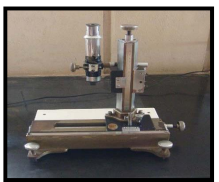
Fig. 6: Travelling microscope