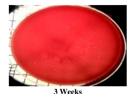
Fig. 3: Comparison of colony forming unit at baseline & 3 weeks in Group C

Statistical Analysis: Statistical analysis was carried out using Statistical Package for Social Sciences (SPSS Inc., Chicago, IL, version 16.0 for windows). Test for qualitative variables, mean and standard deviation were calculated. Gingival index, Plaque index, Probing Pocket Depth and RAL were compared statistically between the groups using one way ANOVA and Kruskal Wallis test.