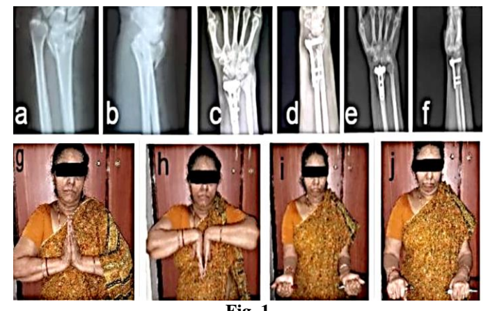
Fig. 1 a-b: Preoperative radiographs of a 58yr female, AO 23-C1 fracture c-d: Immediate Postoperative Radiographs e-f: Radiographs at 14 month g-j: Functional outcome at 14 months