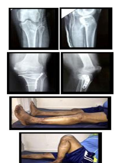
Fig. 4: Schatzker type 3 fracture. ORIF with Plating