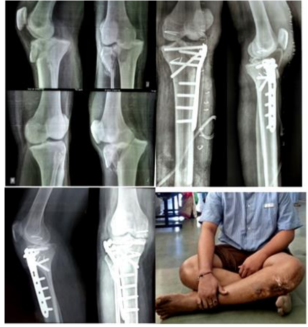
Fig. 5: Schatzker type 4 fracture. ORIF with Plating