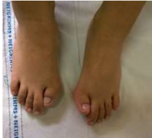
Fig. 1a & 1b. FOP: Radiograph picture of bilateral congenitally deformed short great toes and clinical

Another extremely rare disease CRMO (Chronic Recurrent Multifocal Osteomyelitis) with prevalence of only 1-2 /2,000,000 was diagnosed (8) in a six year old girl from Assam (Table 1). This was a curious autoinflammatory disorder (Table 1). This child presented with delayed wound healing in her left elbow after incision & drainage performed elsewhere. Wound margin biopsy showed subacute nonspecific inflammation with prominent neutrophilic infiltration. Radiograph revealed osteitis and osteolysis in the lower end of humerus without sequestrum (Fig. 2 a & 2b). Magnetic resonance imaging ruled out neoplasms. Wound cultures were repeatedly negative for microorganisms. There was past history of similar painful skin lesions and delayed wound healing. Diagnosis of chronic CRMO was entertained by a process of exclusion. She required a prolonged treatment with Salfasalazine, Methotrexate, NSAID and corticosteroids to control her disease (8, 9, 10) but this has led to dwarfism and Cushingoid features.