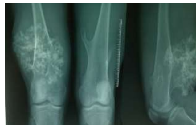
Fig. 5: HME: Knee radiograph showing a large popliteal Osteochondroma

We found one interesting rare case of ulcerating tophaceous gout involving knee and ankle in an educated twenty nine year old male from Assam complicated by falciparum malaria. Malaria is endemic to Assam Meghalaya and many NE states. Recent research shows that Falciparum malaria is known to increase serum uric acid level; (21) study even indicates that allopurinol can be an additive to quinine to bring about both faster eradication of Plasmodium falciparum. (22)