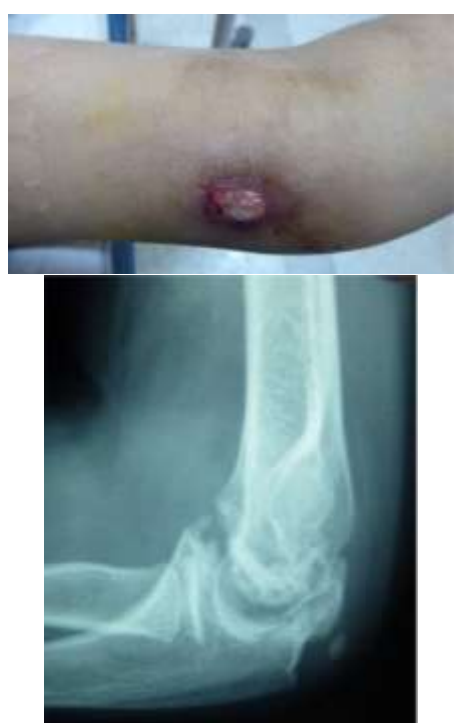
Fig. 2a & 2b: CRMO: Clinical and radiographic views of elbow lesions

The commonest variety with worst prognosis especially with Neurofibromatosis. Resection of pseudoarthrosis and fibular bone graft, IM Rod plus Ilizarov Ring fixator. Middle tibial segment moved distally to provide metaphyseal lengthening & pseudarthrosis compression. Delayed union of proximal tibial corticotomy required bone marrow injection, Valgus angulation at knee >70 occurred. Lisch nodules were found in ophthalmological examination