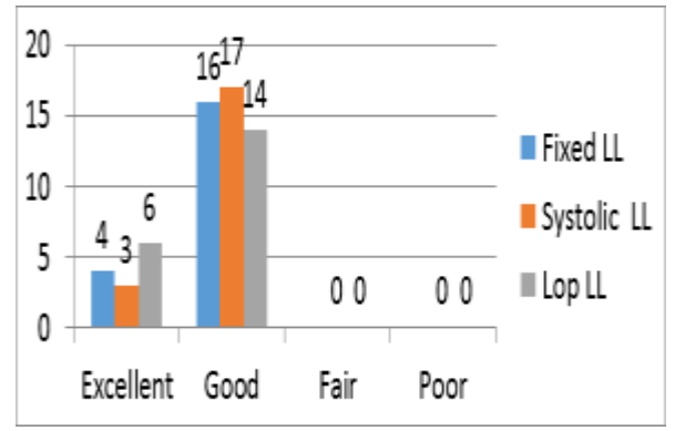
Fig. 2: Graph showing bloodless field in the lower limb