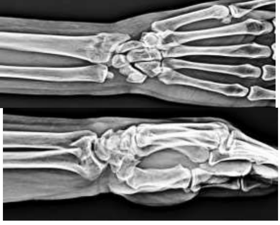
Pre-operative X-ray: AP & Lateral (48yr/m)