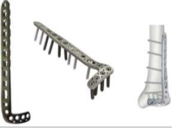
Fig. 2: Anterolateral distal Tibia LCP

Features of anterolateral LCP: The 3.5mm anterolateral distal Tibial plate is a LCP system made of stainless steel with limited-contact shaft profile. The combi-holes in the LCP shaft combine a dynamic compression unit (DCU) hole with a locking screw hole. Locking screws provide the ability to create a fixed-angle construct especially in osteopenic bone and multi-fragmentary fractures where screw purchase is compromised. Features of this include anatomically shaped, 3.6mm shaft thickness which tapers to 2.0mm distally, 60° twist in shaft is contoured for the distal Tibial anatomy, tapered tip for sub muscular insertion. Distal locking screws provide support for the articular surface, targeted locking for Volkmann's triangle and Chaput fragment.