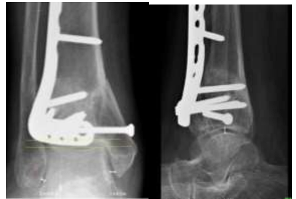
Fig. 6: Post op X ray showing Radiological alignment

The normal post-operative alignment achieved during this study was comparable to the existing studies on intramedullary nail fixation alone, i.e., Nork et al and Ehlinger et al,<sup>(9)</sup> as well as the comparative study on LCP and intramedullary nailing by Yang et al<sup>10</sup> and Mauffery et al.<sup>(11)</sup>