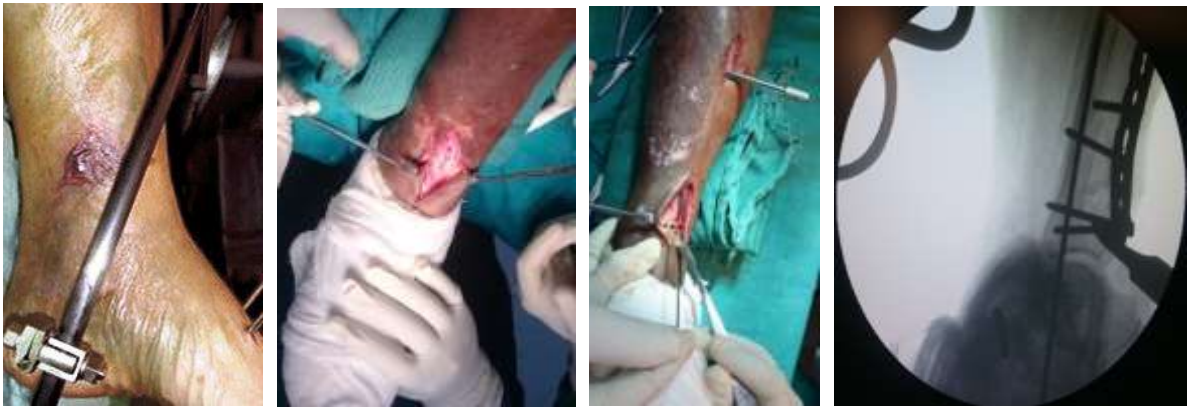
Fig. 3: Wrinkle sign, skin incision, plate introduction and intra-operative c arm image

minimum of 5-6 holes above the fracture site was selected. A submuscular plane is made using the Cobbs elevator and a pre-contoured plate was slid beneath the anterior compartment muscles and the neurovascular bundle. The proximal most hole of the plate was identified by C arm and was provisionally fixed by k wire. To achieve proper seating 3.5 mm cortical screws are applied in most cases. Later 3.5mm locking screws were applied in the sequential manner first in the distal horizontal holes and then proximal holes in alternate manner with least three screws in the diaphyseal segment. In some cases 3.5 mm cortical screws were used to achieve inter-fragmentary compression. Wound closed in layers after haemostasis over a suction drain.