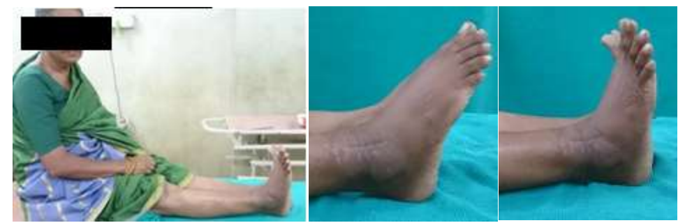
Fig. 5: Clinical picture with functional outcome