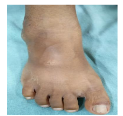
Fig. 1: Clinical picture showing diffuse swelling in midfoot region

subsidence in the pain and swelling, suggesting correct diagnosis and treatment.