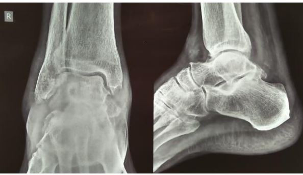
Fig. 2: Ankle plain radiograph showing arthritic changes