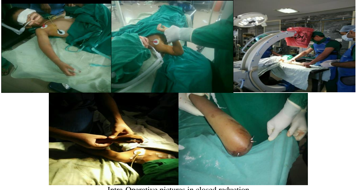
Intra-Operative pictures in closed reduction