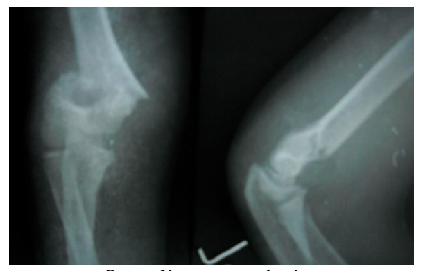
Pre-op X-ray open reduction