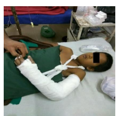
Post-operative immobilization with above elbow slab