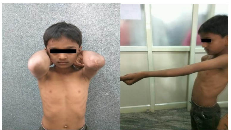
Post-Operative ROM in open percutaneous pinning at 12weeks