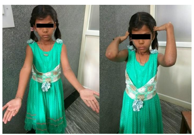
Post-op range of movements in closed percutaneous pinning at 8weeks