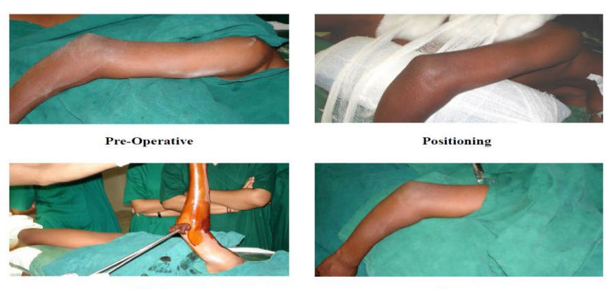
Praint Pre-Operative pictures of open reduction