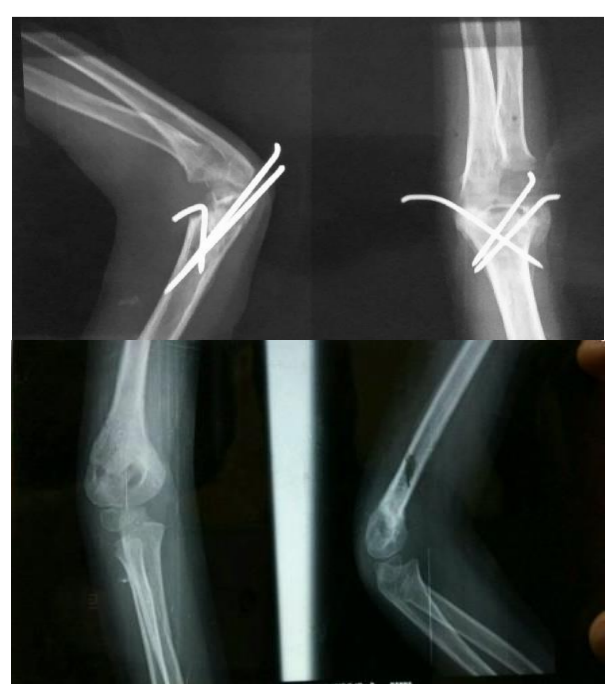
Post-Operative X-ray in closed reduction