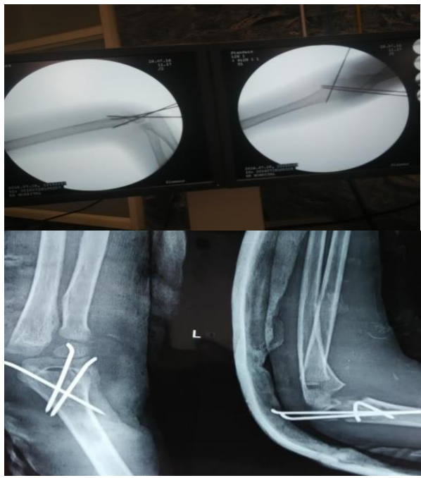
Intra-Op X-ray of closed reduction