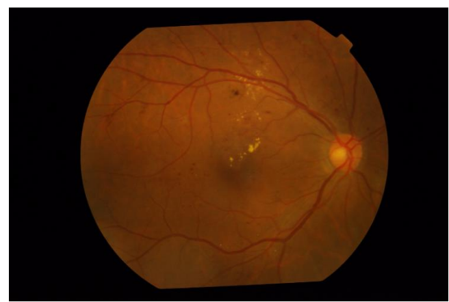
Fig. 1: Diabetic retinopathy with DME