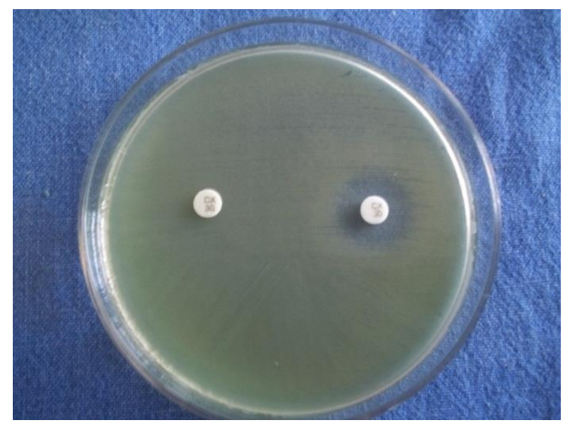
Fig.2: Phenyl boronic acid test for AMP

Screening and detection of AmpC β-lactamases: Isolates resistant to cefoxitin (30\mu g) or showing no increase in zone diameter with addition of inhibitor were suspected to be AmpC producers. These isolates were subjected to phenyl boronic acid (PBA) disc enhancement method. In this method, two cefoxitin discs (30\mu g) were placed on Mueller Hinton agar plate lawn inoculated with a 0.5 McFarland turbidity adjusted suspension of the test strain. To one of the discs, 400 µg phenyl boronic acid (Sigma-Aldrich) was added. After overnight incubation at 37°C, the zones of inhibition were measured. Enhancement of zone by 5mm around a cefoxitin disc with PBA, in comparison with a disc with cefoxitin alone, was taken as a positive result for AmpC production.<sup>(9)</sup> (Fig.2)