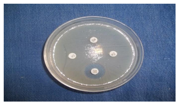
Fig.1: CLSI phenotypic confirmatory test for ESBL

Screening and detection of ESBL: All isolates showing reduced susceptibility to ceftazidime (zone diameter of \leq 22mm) and cefotaxime (zone diameter of \leq 27mm) were selected for ESBL production. The CLSI doubledisk diffusion test was performed for the confirmation of ESBL. A 0.5 McFarland of Gram negative isolate was swabbed on Mueller Hinton agar plate and disk of ceftazidime (30µg) and ceftazidime/clavulanic acid (30/10 µg) were placed. After incubation, an enhanced zone of inhibition \geq 5mm around ceftazidime/clavunic acid in comparison with ceftazidime disc alone was confirmed as ESBL.<sup>(8)</sup> Klebsiellapneumoniae ATCC 700603 and Escherichia coli ATCC 25922 were used as positive and negative controls respectively.(Fig. 1)