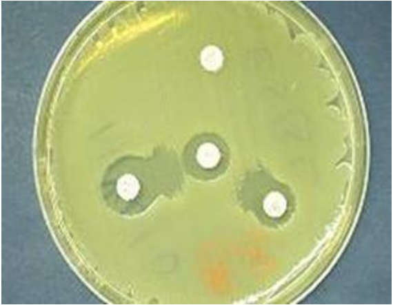
c) Distortion of zone of inhibition produced by an ESBL isolate on DDST