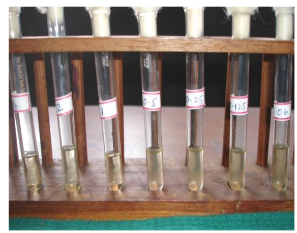
b) Vancomycin MIC for Staphylococcus aureus (MIC = 1)