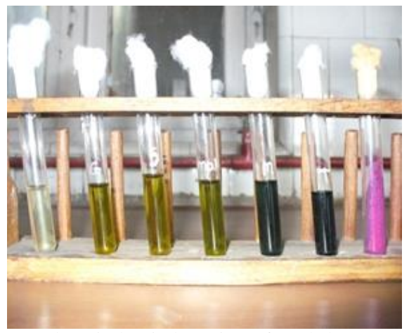
d) Biochemical reactions of Staphylococcus epidermidis