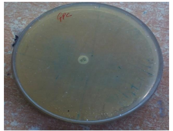
Fig. 2: Cefoxitin Resistant Isolate