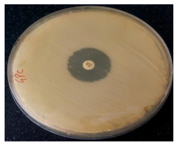
Fig. 1: Cefoxitin Sensitive Isolate

Two standard strains, one Methicillin sensitive S. aureus (MSSA) ATCC (29213) and one MRSA ATCC(43300) were included in each batch of testing by different method.