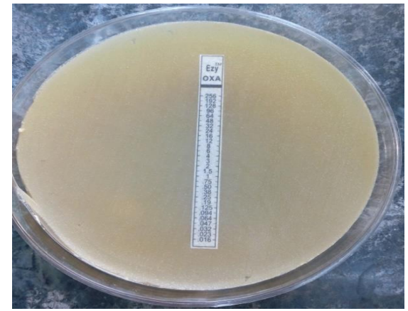
Fig. 4: E-test MIC Oxacillin Resistant isolate