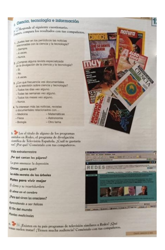
Figure 5: The exercise is taken from the manual "Español Lengua Viva 2" Source: VVAA. " Español lengua viva 2 ". Spanish manual for foreigners. Madrid, Santillana Educación, 2007, 161.

Projects on textbooks: these include analysis of texts (newspapers, web, literature) and their reproduction criticizing on the text, acting on the given context, making analogy, etc. This kind of project can take place mainly in the auditorium. The example image below shows an exercise - project on textbooks, exercise a) requires the student to complete a questionnaire on the news and newspapers they read checking and then comparing the answers with each other; exercise b) requires that students read the titles of TV programs provided generally in Spanish television, asking if they know them and what are their favorite programs. Further we need to comment and to analyze with each other; exercise c) observes the practice of analogies. Comparisons of the programs broadcasted in Spain are made with the place where we live. This type of project on the text is an example of admission to tasks and develops communication and socio-cultural abilities.