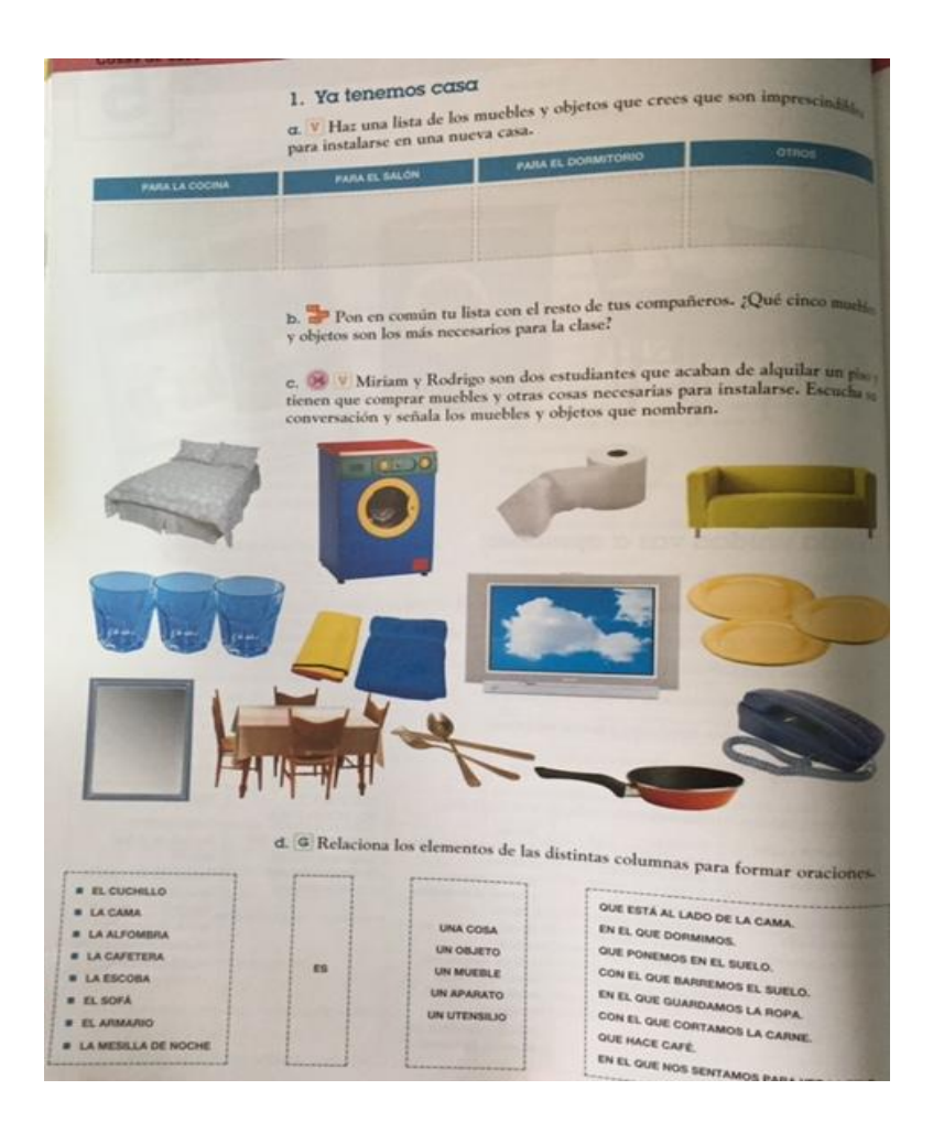
Figure 1. An exercise taken from the manual: Español Lengua Viva 2

Let's give another example of an exercise where the main focus is the lexicon and the topic of conversation is over the household and their description. Along with the lexicon in this activity students should use the vocabulary related to the topic and form sentences by listing words according to the rules of syntax in Spanish.