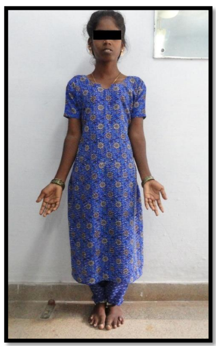
Figure 2a: Cubitus Valgus

investigations revealed hypothyroidism and increased anti-thyroid antibody levels suggestive of Hashimoto thyroiditis. Ultrasound imaging had