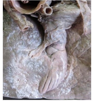
Fig. 3: Intrahepatic gall bladder