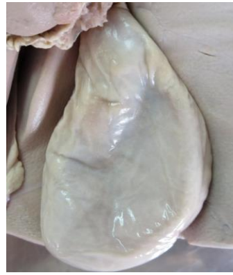
Fig. 1: Pear shaped gall bladder