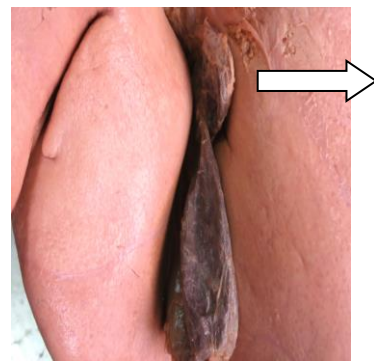
Fig. 5: Gall bladder showing hartmann's pouch