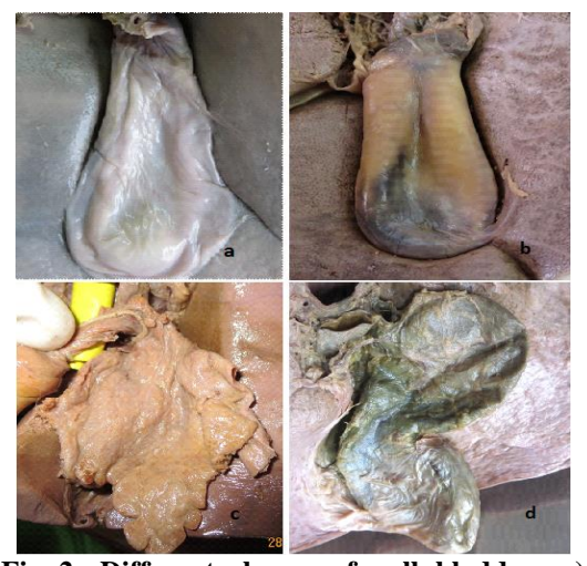
Fig 2: Different shapes of gall bladder: a) Flask shaped b) Cylindrical shaped c) Irregular shaped d) Hour glass shaped