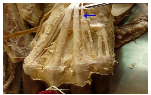
Fig. 2: Shows type 3 juncturae tendinum (blue arrow) connecting ED ring finger and EDM

The total hands studied were 26 from 13 cadavers. The ED was found to divide only into three tendons and EDM as two tendons in all the 26 hands (Fig. 1). In 24 hands, type III Junction tendinae was seen connecting ED tendon for ring finger with tendon of EDM (Fig. 2). In two hands type II, transverse type junction tendinae was noted (Fig. 3). The ED tendons for other digits were often noted to be more than one in number. Since the focus of this study was the contribution of ED for little finger we did not add more description on this observation.