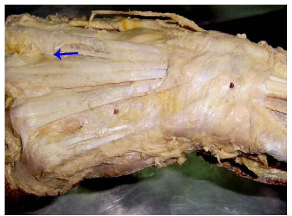
Fig. 3: Shows type 2 transverse juncturae tendinum (blue arrow) connecting ED ring finger and EDM