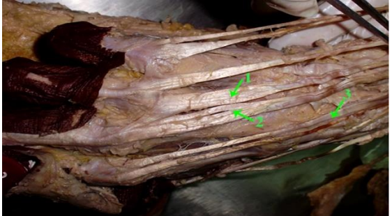
Fig. 1: ED showing only three tendons to Index (1), Middle (2), Ring (3) digits and two tendons of EDM