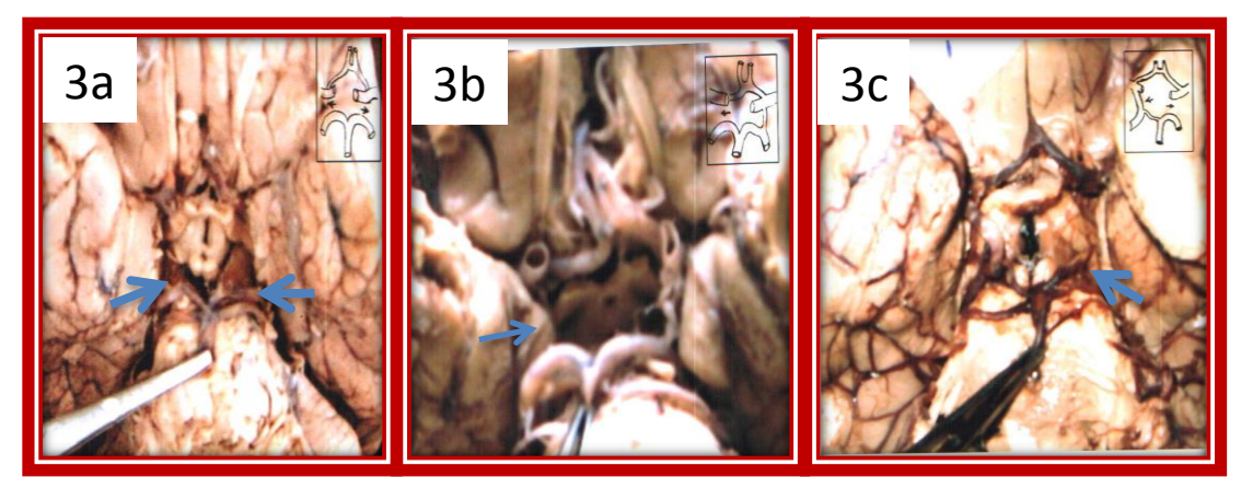
Fig. 3: Showing the bilateral absence of PCoA (3a), right unilateral (3b), left unilateral (3c) absence of PCoA