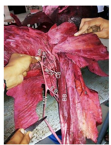
Image (c): MCN-Musculocutaneous Nerve, CB-coracobrachialis, BB-Biceps brachii, EB-Extra branch.

Here MCN is arising from MN & it is supplying CB, BB & Brachialis. An extra branch (EB) is arising from the MN which is also supplying BB & brachialis. Thus in our case Biceps brachii & brachialis muscle is innervated by 2 nerves