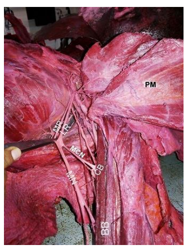
Image (b): MR- medial root of Median, LR- Lateral root of Median, MN- Median nerve, MCN- Musculocutaneous nerve, CB- Coracobrachialis, PM- pectoralis Major. In our case MR is joining LR to form MN & MCN is arising from the median nerve