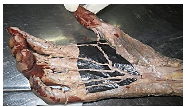
Fig. 2: Type 2 complete arch: Ulnar artery (1) and princeps pollicis artery (2) Right

Type 2 complete arch: Arch completed by ulnar artery and princeps pollicis branch of radial artery. Out of 31 complete arches 3(7.5%) hands presents this pattern. Radial artery in the present case passes dorsally at wrist and traverses the anatomical snuff box. It passes between the two heads of first dorsal interosseous muscle and enters into the palm. In the palm it completes the arch by anastomosing with terminal end of ulnar artery and supplies the thumb as arteria princeps pollicis. (Fig. 2)