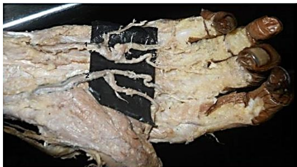
Fig. 5: Type 2 incomplete arch: Ulnar artery (1) & superficial palmar branch of radial artery (2) without anastomosis (Right)

Type 2 incomplete arch: In this type, the palm is supplied by ulnar artery and superficial palmar branch of radial artery separately without any anastomosis between them. It is seen in 2(5%) hands. Medial three fingers are supplied by ulnar artery and lateral two fingers are supplied by superficial palmar branch of radial artery. (Fig. 5)