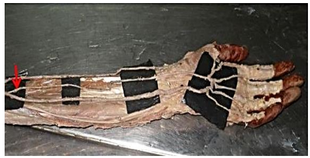
Fig. 3: Type 3 complete arch: Ulnar artery & median artery. (Arrow-Median artery arising from ulnar artery) (Left)

Incomplete arches are seen in 9 hands and 2 different patterns were observed.