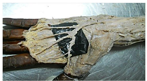
Fig. 4: Type 1 incomplete arch: Ulnar artery (1) alone. (Left)

Type 2 incomplete arch: In this type, the palm is supplied by ulnar artery and superficial palmar branch of radial artery separately without any anastomosis between them. It is seen in 2(5%) hands. Medial three fingers are supplied by ulnar artery and lateral two fingers are supplied by superficial palmar branch of radial artery. (Fig. 5)