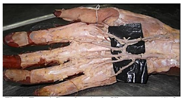
Fig. 1: Type 1 Complete Arch: Ulnary artery (1) & superficial palmar branch of radial artery (Right)

Type 1 Complete arch: In the present study, the arch completed by ulnar artery and superficial palmar branch of radial artery is the most common type, seen in 26 hands(65%). In this pattern the radial artery before passing dorsally to the anatomical snuff box, gives superficial palmar branch which passes to the palm either superficial or deep to the thenar muscles and ends by anatomosing with terminal end of ulnar artery.(Fig. 1)