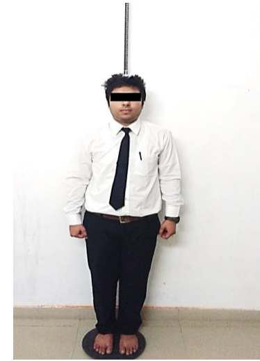
Fig. 1: Method of Measuring the Body Height

While collecting data, all the instruments were checked for accuracy and precision. The subjects were measured by the two authors separately. If a difference in reading was observed then a third reading was taken to ensure accuracy.