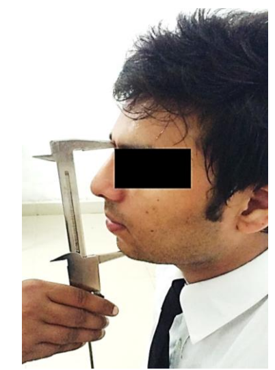
Fig. 2: Method of Taking the Facial Height