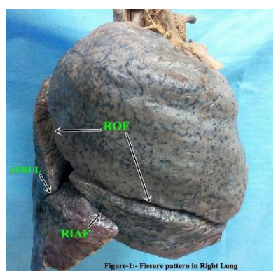
Fig. 1: Fissure pattern in Right Lung ROF: Right Oblique Fissure RIAF: Right Inferior Accessory Fissure AFRUL: Accessory Fissure In Right Upper Lobe

All these observations were made while taking a heart lung specimen from a cadaver to prepare a museum specimen after regular dissection class.