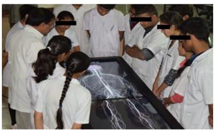
Fig. 2: Students using "Anatomage" virtual dissection table to learn neuroanatomy