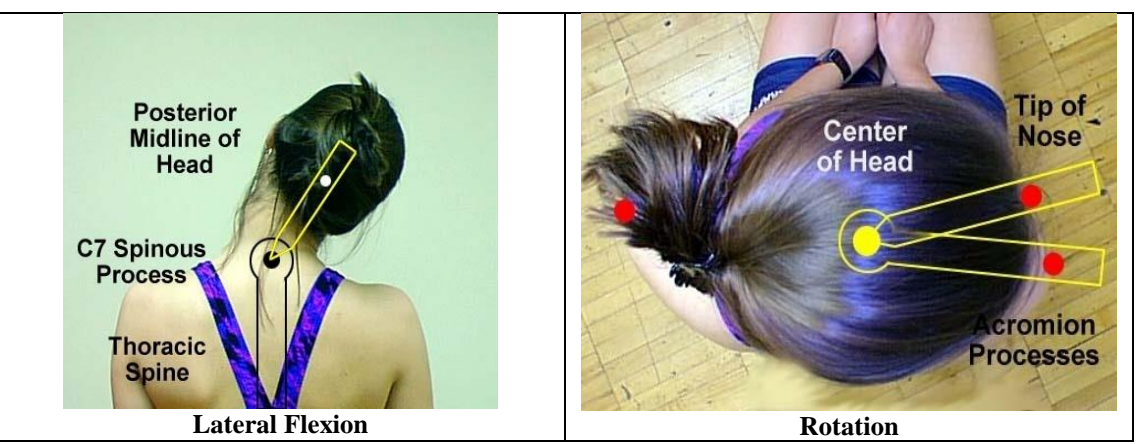
Fig. 1: Showing Positions to Measure Flexion, Extension and Lateral Flexion & Rotation of the Cervical Spine<sup>(7)</sup>