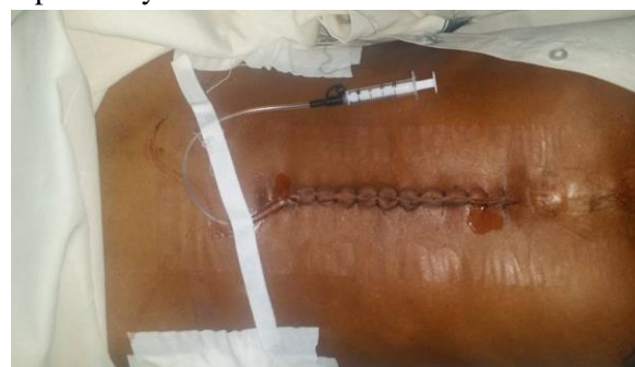
Figure - 1: Subcutaneous DT kept in the laparotomy wound site.

explained in their local language. All patients in the group were assigned as study and corresponding matched control were selected. The following parameters were taken and observations were recorded and tabulated and analyzed to achieve the objective. The study group patients which included cases of abdominal surgeries with class III and class IV type of wounds, preoperatively a single adult dose of Inj. Amikacin was applied over the 'subcutaneous cavity' of the incision site prior to skin closure. A Subcutaneous DT was kept (8 or 10 size feeding tube) ( Figure – 1 ). Subsequently patient received a single daily adult dose (as per body weight) of Inj. Amikacin on the first 3 post-operative days (POD 1 to POD 3). The Subcutaneous DT was intentionally closed without any suction drainage, to avoid confounding effecting of keeping a subcutaneous suction DT [8].