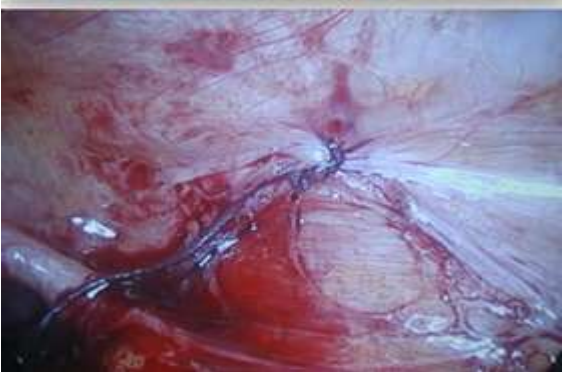
Fig. 3. Laparoscopic ring closure: completion of the purse string suture and occlusion of the internal ring.

The patient was discharged on the third postoperative day. On physical examination performed on postoperative 10 days control, it was observed that the testes were viable and located at the scrotum [Fig. 4].