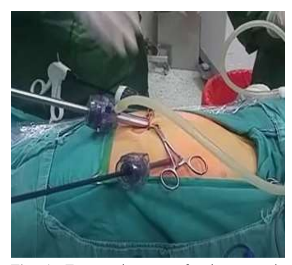
Fig. 1. Trocar placement for laparoscopic procedure.

After obtaining parental consent for whole of procedure which consist diagnosis and treatment in the same session, the patient prepared for operation. Firstly, a physical examination under general anesthesia was performed prior to the surgical procedure in order to plane the surgical approach for patient with NPT. Then the child was supine and crossed his legs, placing the non-dominant hand just above the symphysis, we inhibited the cremasteric reflex. We made the milking movement to move the testis towards the scrotum. No testis was detected in the inguino-scrotal region.