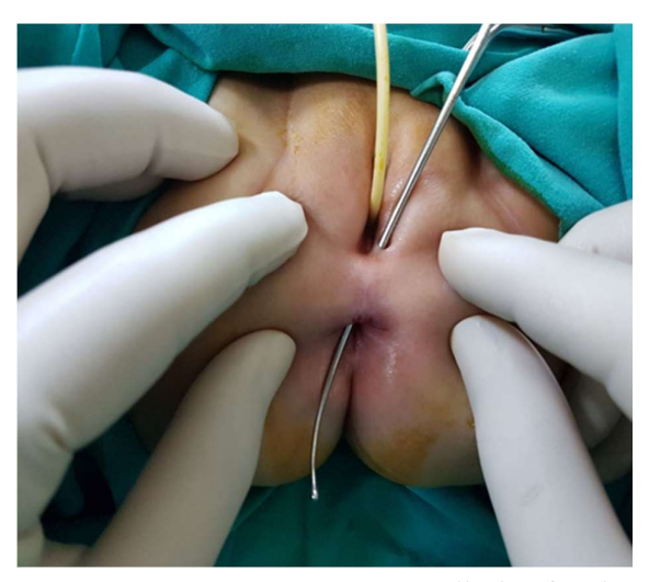
Fig. 2. Case 1, H-type rectovestibular fistula, the Hegar dilator crossing the tract and the two openings of the fistulous tract are shown.