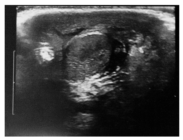
Fig. 1 . Left scrotal ultrasound with evidence of very pronounced thickening of skin and Dartos fascia.

palpable purpura that starting on the ankles and dorsum of the feet and extending up to the thighs, with associated joint pain, periocular edema and diffuse aching abdominal pain. His vital signs were stable, with a blood pressure of 127/96 mmHg (high for age and size), a pulse rate of 70 beats/min. Urinalysis showed proteinuria of 2.35 g/day without hematuria and creatinine clearance of 103.0 L/day. Laboratory test showed a moderate elevation of erythrocyte sedimentation rate and Creactive protein, while Rheumatoid factor, antinuclear antibody, p-ANCA, c-ANCA, blood cultures, urethral cultures, hepatitis B and hepatitis C serology were negative. Full blood count and biochemical profile were unremarkable. The working diagnosis of HSP was adopted and intravenous hydration was started. After Two days the patient showed tender bilateral erythematous scrotal swelling which was greater on the left side. For the suspicion of an acute scrotum, a testicular US was urgently carried out showing the presence of bilateral marked edema of the skin and Dartos fascia with hypervascularity, without involvement of the deeper layers, testes, or epididymis and mild reactive hydrocele, without signs of torsion [Fig. 1].