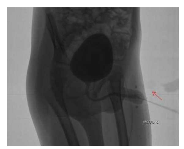
Fig. 3. Micturating cystourethrogram showing two streams, no reflux, smooth walled bladder.

meatus. It was seen in distal urethra on urethroscopy [Fig. 4].