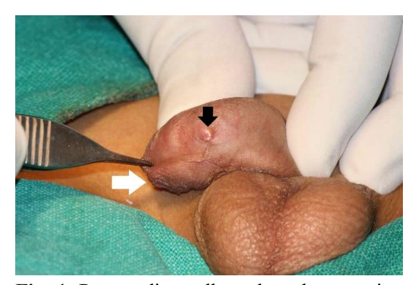
Fig. 1. Paraspadiac collateral urethra opening in distal penile region at 3 'O clock position marked by black arrow. Native urethral meatus is marked by white arrow.

A four-year male child was referred to us with double urinary stream. There was no history of trauma or urethral instrumentation in past. Main stream was straight whereas another thin stream was directed on left side. This sometimes caused soiling of the clothes. There was no history of dysuria or urinary infections. There was no significant family or past history. On examination, he was uncircumcised. One urinary meatus was located at normal apical position, whereas the other meatus was located on left side in distal penile region in paraspadiac collateral location at 3'O clock position [Fig. 1].