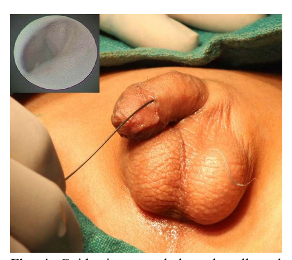
Fig. 4. Guidewire passed through collateral meatus is seen in urethra on urethroscopy (inset).

Rest of the urethra was normal. 6 Fr Foley catheter was passed through the main apical meatus. The paraspadiac collateral duplicated urethra was excised through a circular incision. It was excised up to native urethra. The collateral urethra was opening in the native urethra in its distal penile region [Fig. 5]. It was not coursing proximally up to bladder. The native urethra was repaired in single layer with