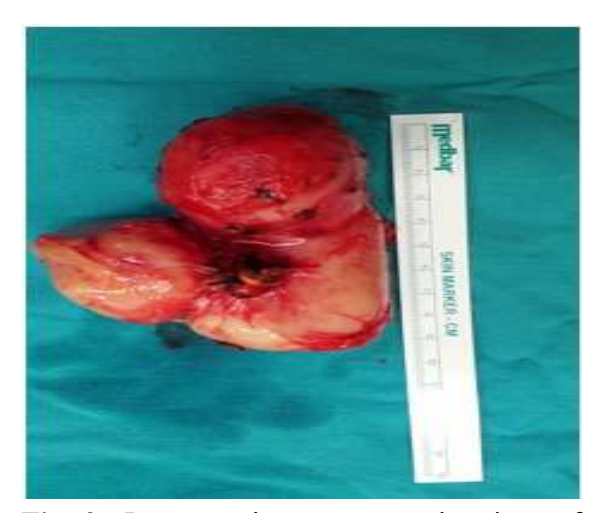
Fig 2. Postoperative macroscopic view of specimen.

Excision with laparotomy was performed for removal of the tumor. During surgery, a mass covered by an intact capsule that adjacent but not attached to kidney and renal vascular structures. Left surrenal gland was also normal and very close to infero-medial part of the tumor. Retroperitoneal tumor was completely removed and left surrenal gland was preserved. Resected tumor was sent for histopathological examination [Fig. 2].