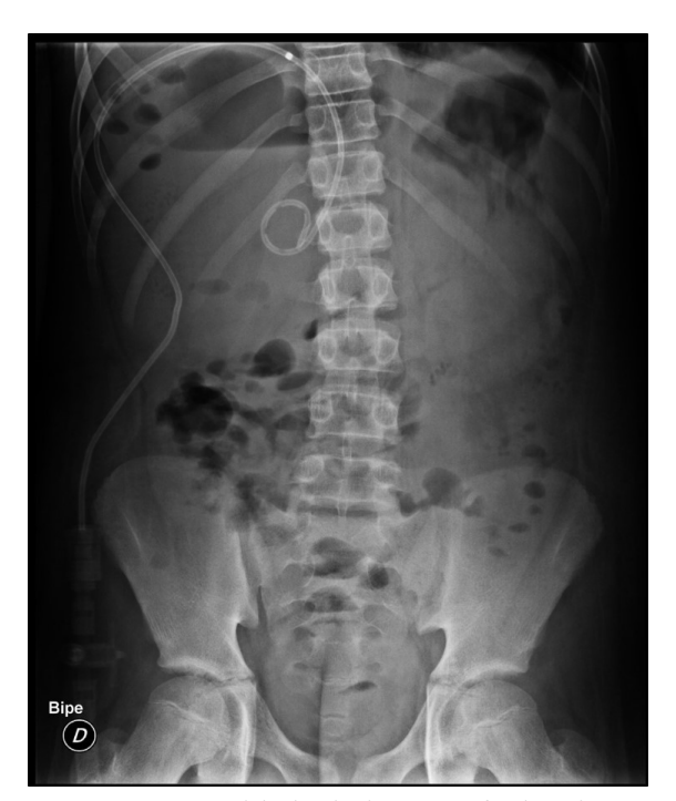
Fig. 2. CT-guided drainage of the intraabdominal abscess by Candida.

The immunity-host defense study and blood and urine cultures were negative. Evolution was torpid despite CT-guided drainage of the intra-abdominal abscess by Candida, requiring laparoscopic debridement with improvement afterwards [Fig. 2].