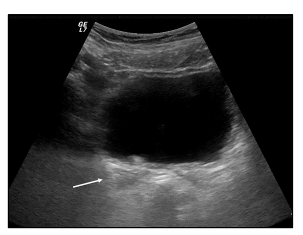
Fig. 4. Echography showing the unstructured US (arrow).

Over 2 years follow-up, the patient has remained asymptomatic with a practically inappreciable US in echography [Fig. 4].